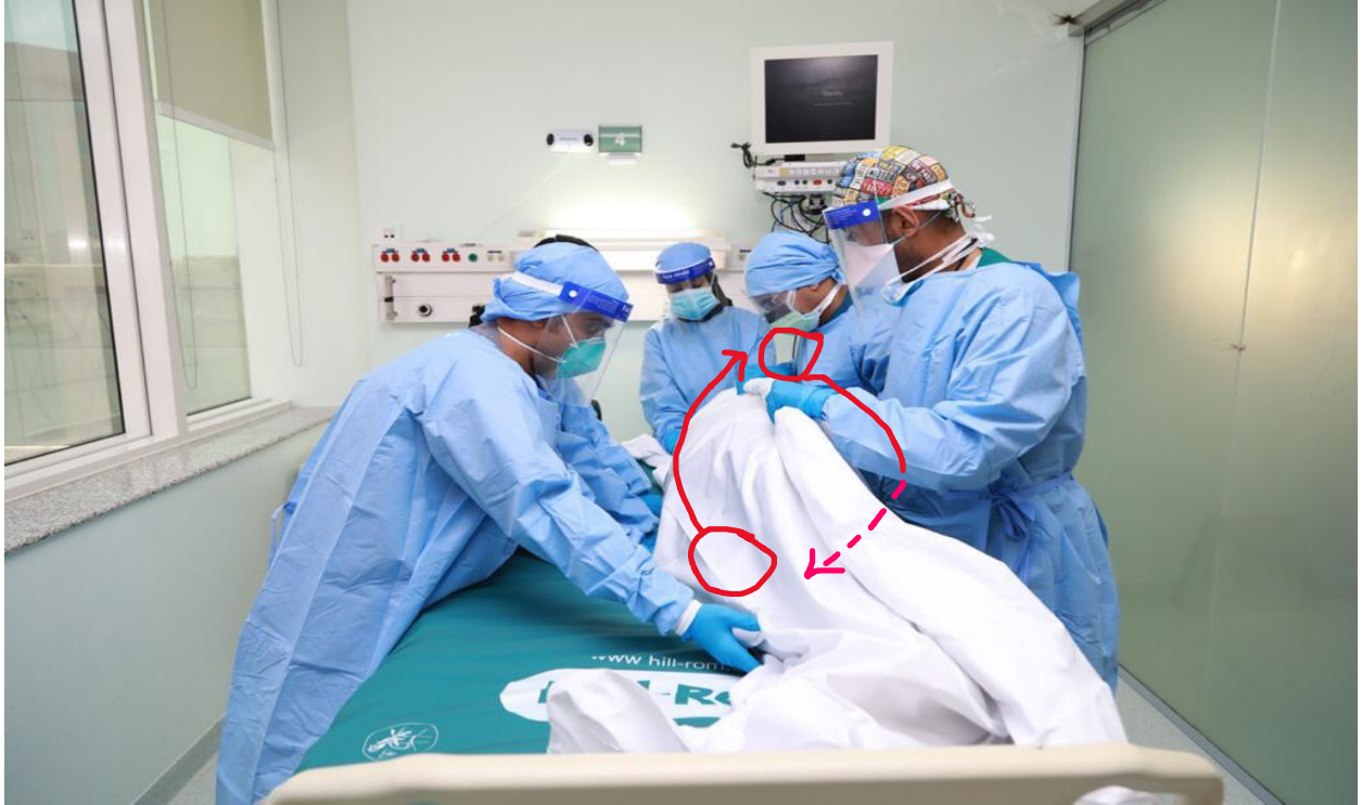
(Fig. 3) shows patient maneuvered into lateral position facing ventilator.