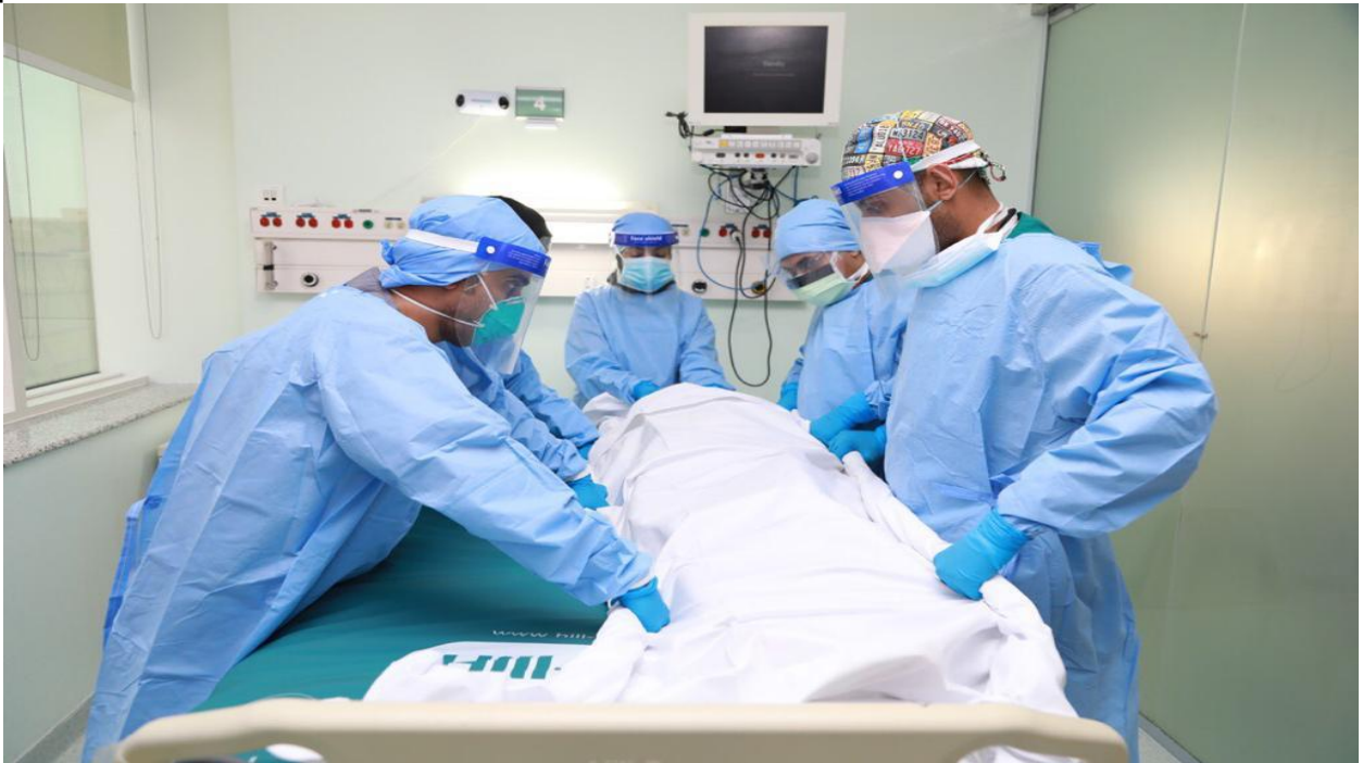
(Fig. 2) shows the patient glided away from the ventilator.