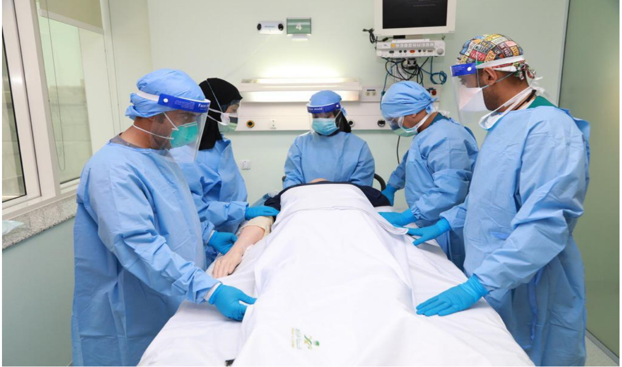
(Fig. 1) shows intensivist /or respiratory specialist and staff members on either side of the patient.