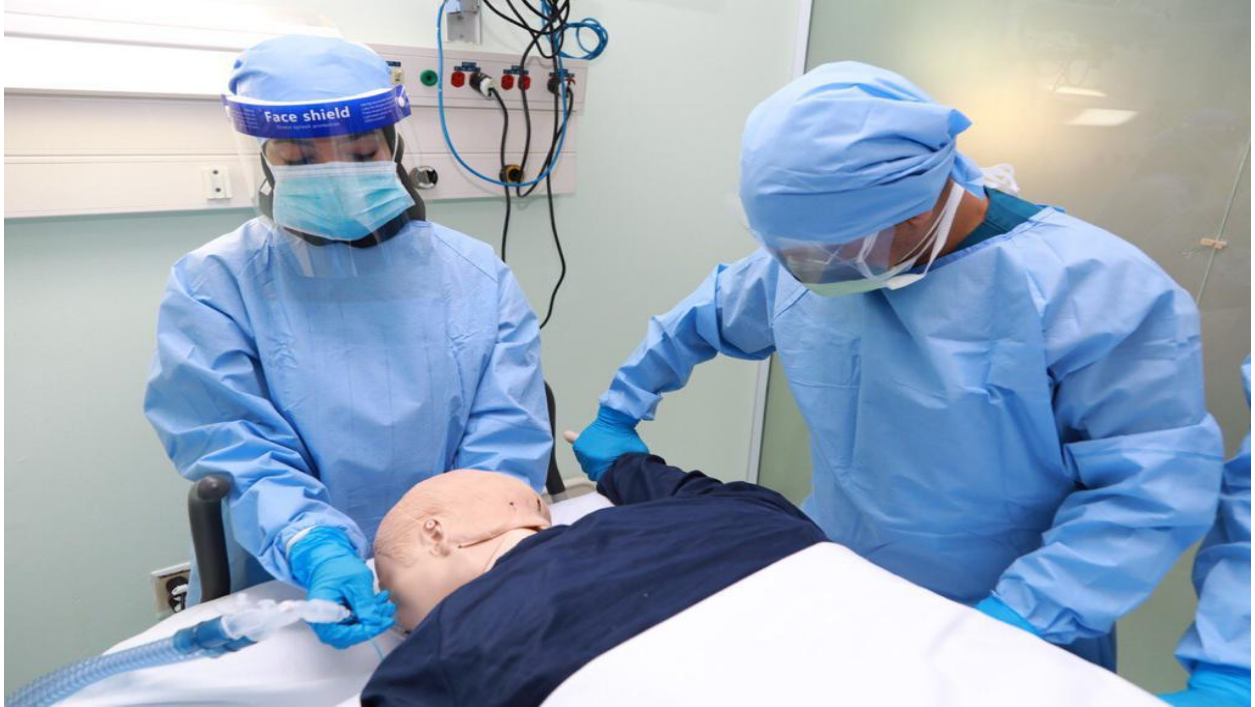
(Fig. 5) shows prone position with head toward the ventilator.