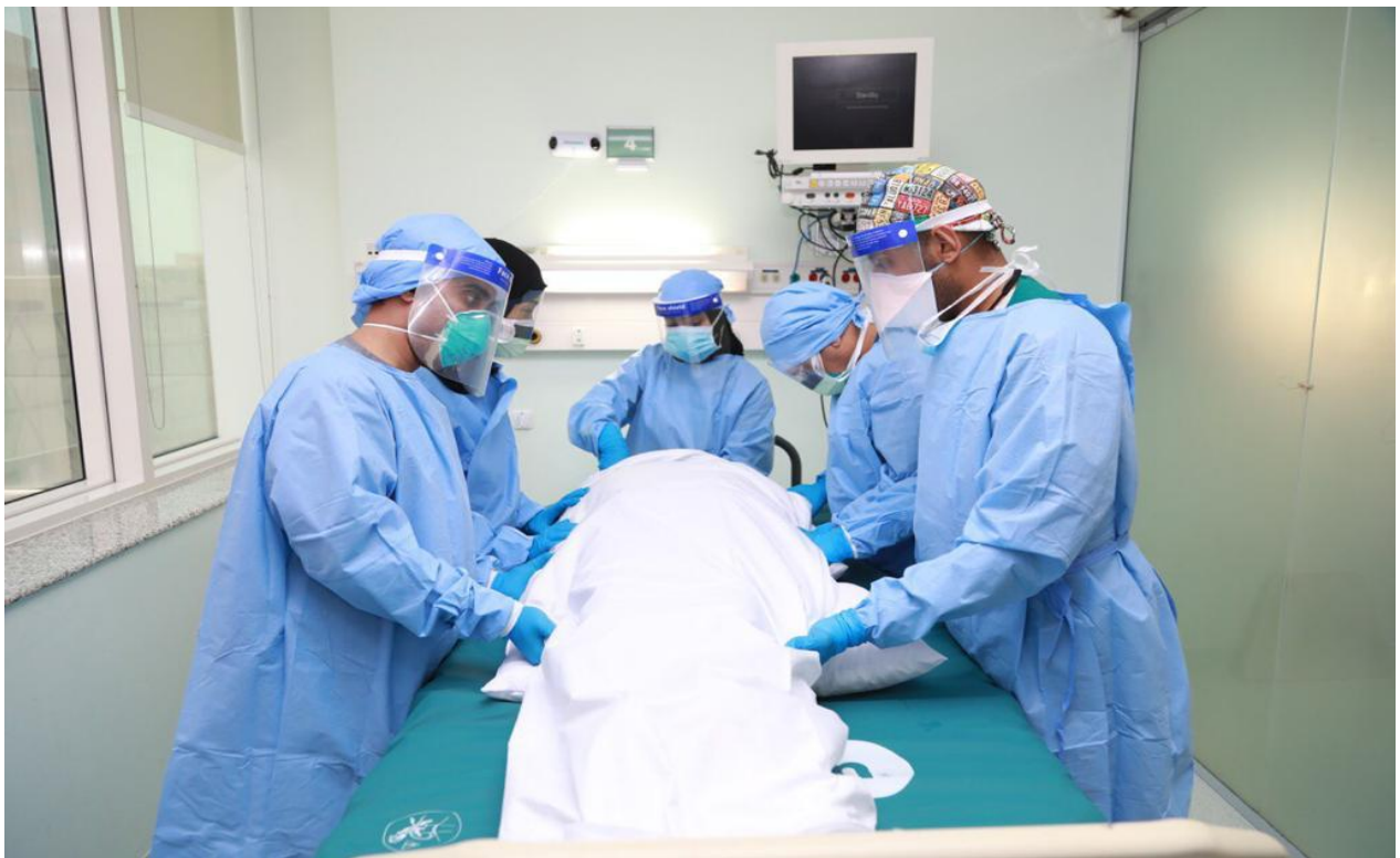
(Fig. 4) shows patient lowered prone toward the ventilator on the pillows.